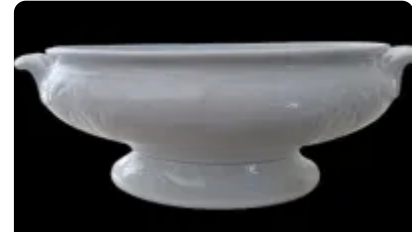
Hughes, Bennett, & Co.