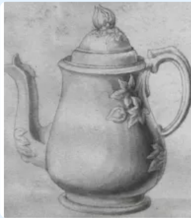
Teapot or Coffee Pot Base and Lid