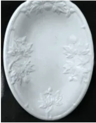
Davenport (& Co.)