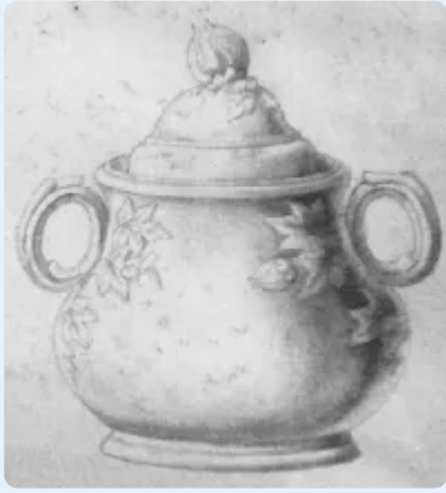
Sugar Bowl with Lid