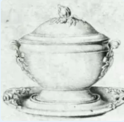
Sauce or Soup Tureen Base, Lid, and Underplate