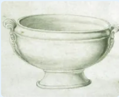
Compote on Tall Pedestal