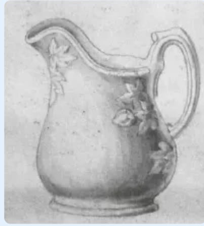
Creamer or Cream Pitcher