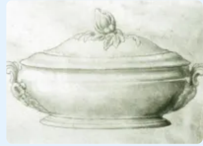
Vegetable Tureen Base and Lid