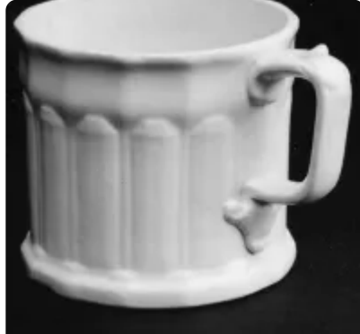
Holland & Green (Late Harvey)