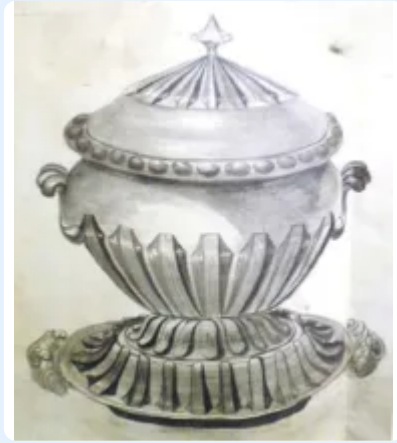
Sauce or Soup Tureen Base, Lid, and Underplate