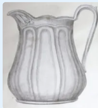
Pitcher - Table - Various Sizes