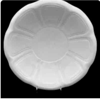
Meigh, Charles & Son