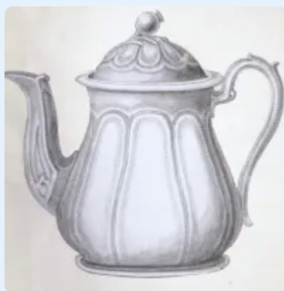
Teapot or Coffee Pot Base and Lid