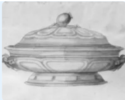
Vegetable Tureen Base and Lid