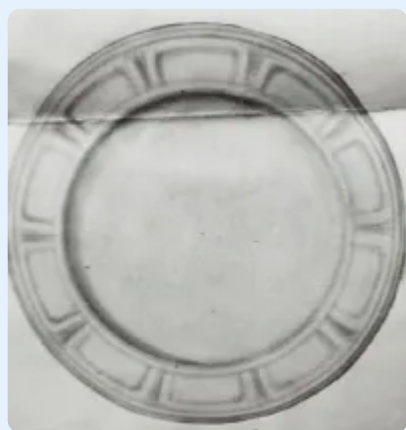
Plate - Various Sizes 4" to 10"