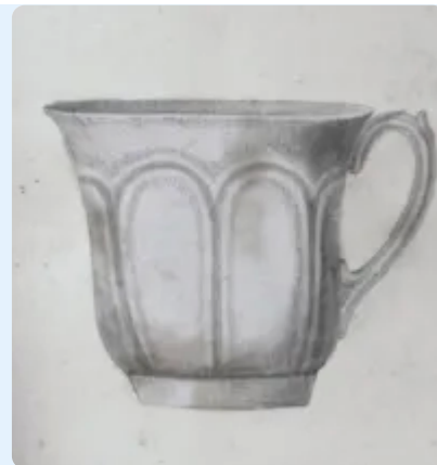
Cup - Handled