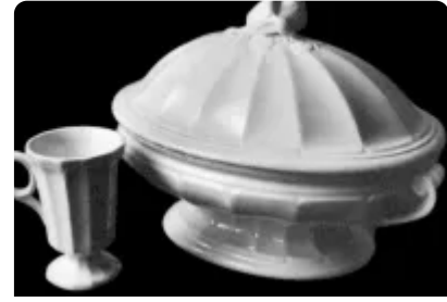
Beardmore & Dawson