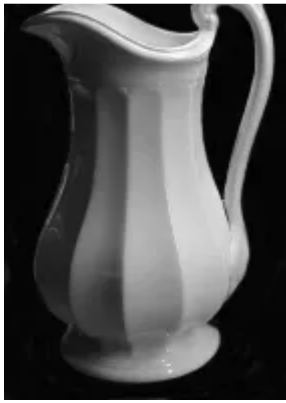
Adams, William & Sons