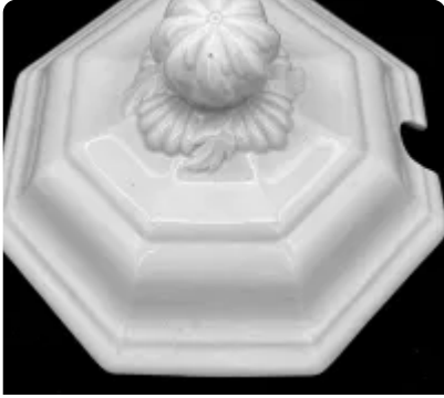
Mellor, Venables, & Co.