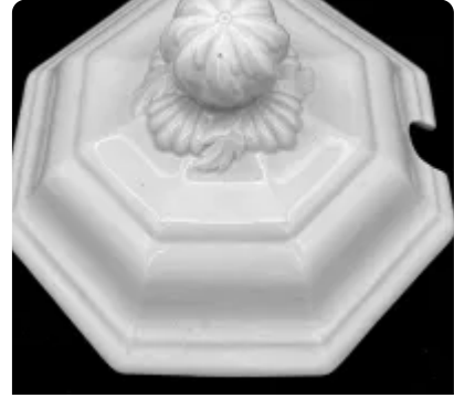
Venables, Mann, & Co.