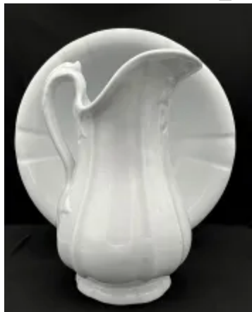
Alternate Panels with Thistle