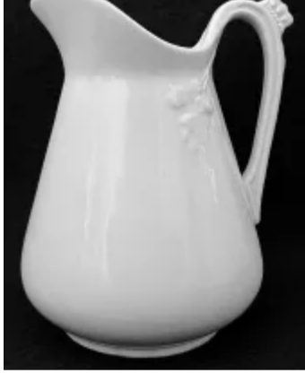
Oak and Acorn