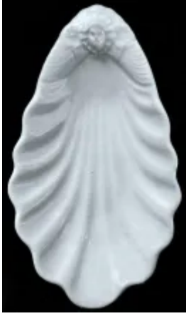
Gothic with Cameo